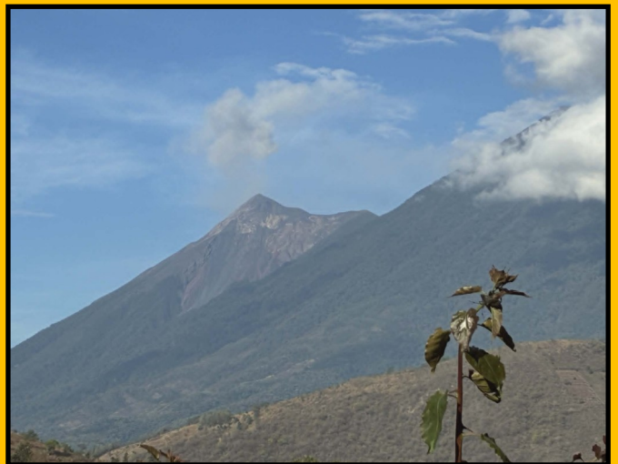
A picture of the volcano that the town of San Antonia is nestled up against. It smoked during the day and glowed hot fire at night!