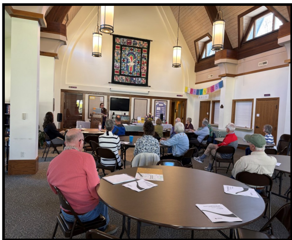
May 14th Red Cross Shelter Training Lunch & Learn

Fifteen participants and friends of our church recently completed the American Red Cross Shelter Fundamentals training, helping prepare our congregation to serve as a welcoming and organized sheltering space during times of community need.