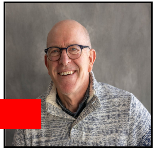
Toby Jones as Mayor Shinn