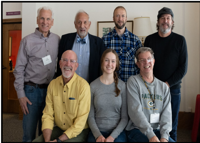
Guatemala Mission Group