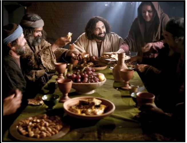
Jesus eating with publicans and sinners

"God created humans in his own image, in the image of God He created them; male and female He created them... God saw ALL that He had made, and it was very good."